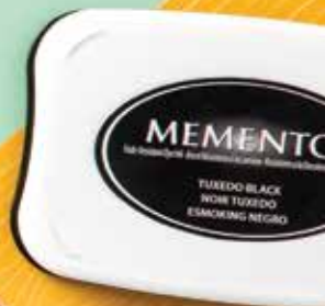
AC P. 147 MENTO™ INK PAD 132708 7,50 € | £5.50