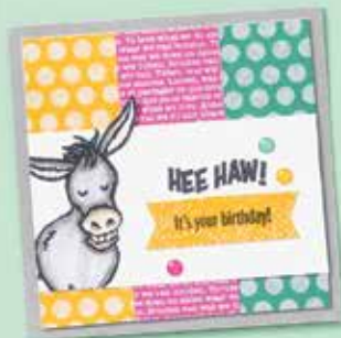
AC P. 143 A4 CARDSTOCK O Whisper White • 106549 11,75 € | £9.00