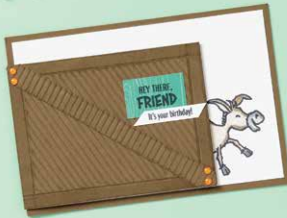
AC P. 144 A4 CARDSTOCK ASSORTMENT Neutrals • 146999 11,00 € | £8.25