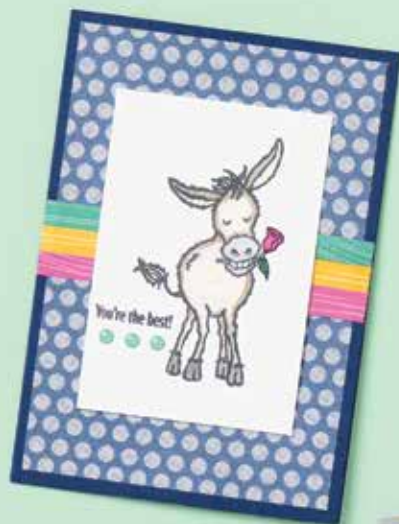
AC P. 158 2020-2022 IN COLOR™ ENAMEL DOTS 152480 9,75 € | £7.50